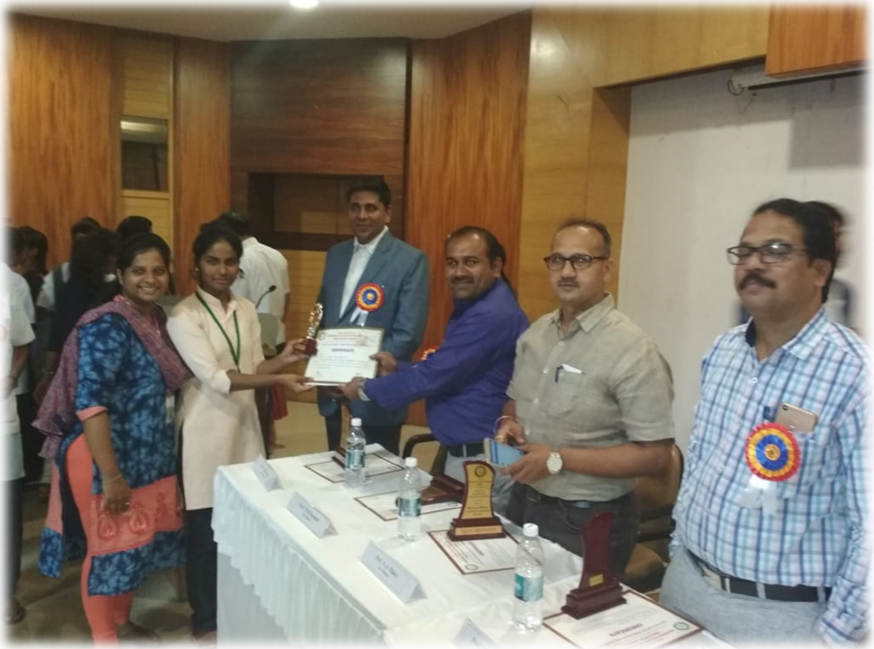
Attested Copies of Certificate preserved at the institute